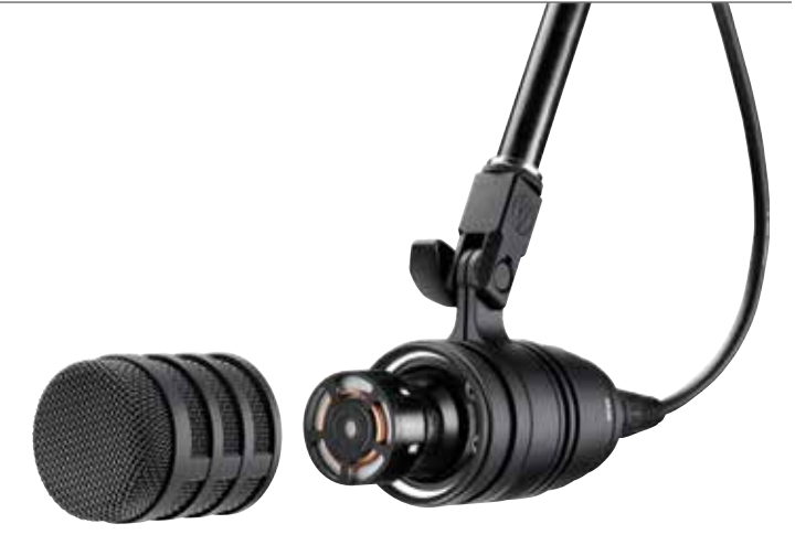
Optimized capsule placement