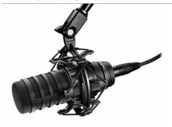
AT8484 Shock Mount (optional accessory)